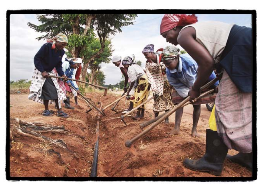
The public are an enormous help: digging a pipeline in Mozambique.

tirement. At this point, we would like to thank him for his untiring and valuable commitment and already now wish him all the very best of health, along with time and leisure for his well-earned retirement!