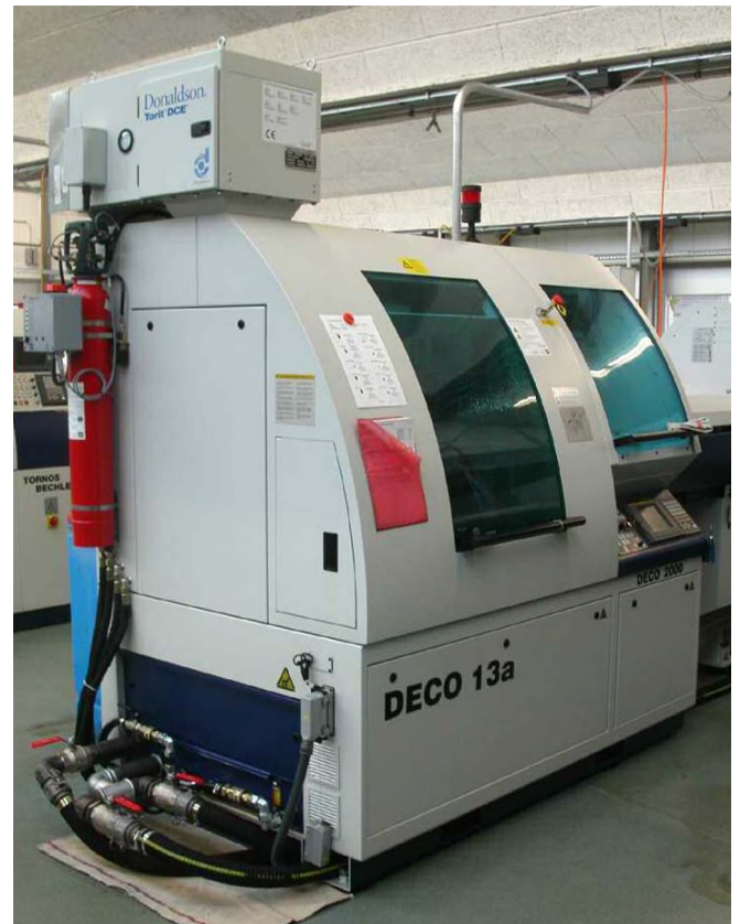
Our fourth fully-equipped DECO 2000/13

This autumn, a film team made a short ad for TV and a film for advertising purposes. You can watch it on www.andresag.com . It shows our company «behind the scenes» and we purposely made no special arrangements for it.