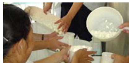
A Swiss cheese maker teaches North Koreans how to produce goat cheese.