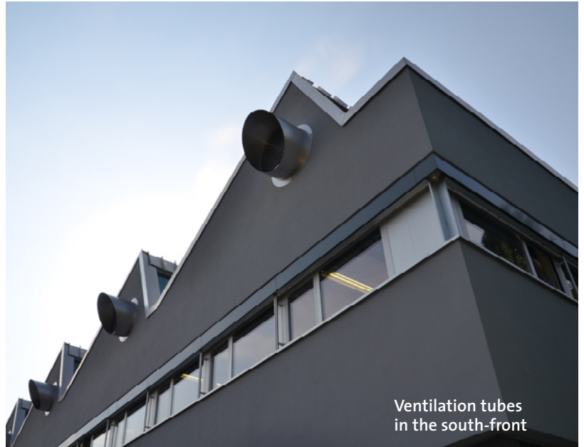
Ventilation tubes in the south-front

By renovating our oldest buildings, we have been able to complete the last stage of our redevelopment. Thanks to exterior insulation, new windows and a new minergie-standard roof, we are able to save on heating costs and to contribute to environmental protection. Everyone is, of course, delighted with the interior renovation, which is a definite upgrade!