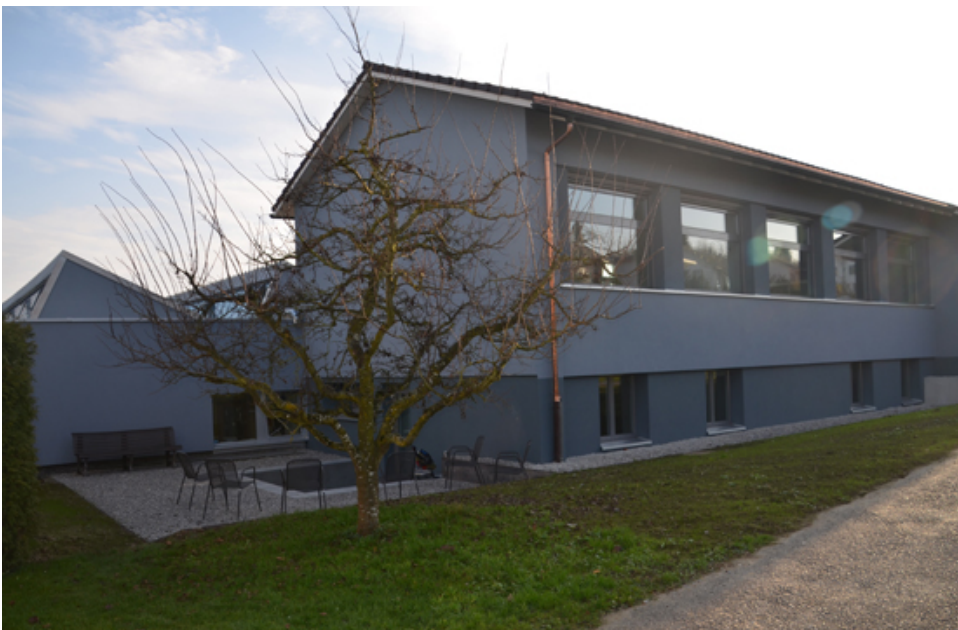
Renovated building including new outdoor seat (north-view)